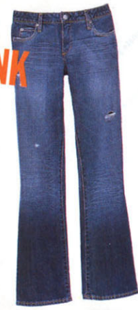
Paper, Denim and Cloth, $142; 800-825-8000