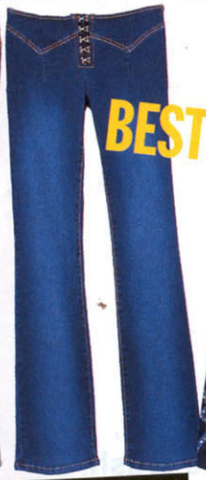
Baby Phat, $68; Babyphat.com (Time for the rodeo)