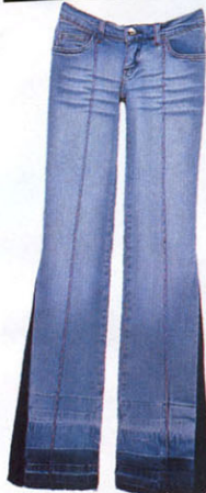
Bisou Bisou, $88; Bloomingdale's (Two-toned)