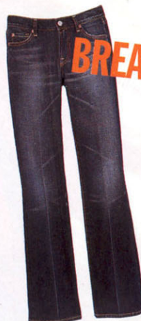
Seven, $106; 800-BARNEYS (Popular for a good reason)