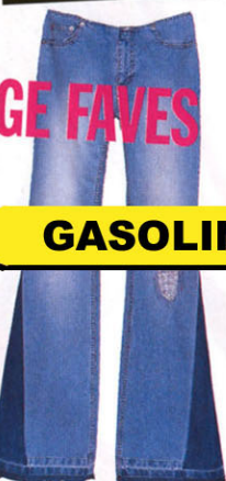
DKNY Jeans, $78; Macy's (The perfect knee hole)