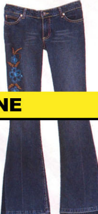
Joomi Joolz, $120; Girlshop.com (Hippie-style florals)