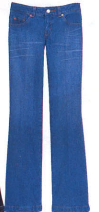
Banana Republic, $70; 888-BRSTYLE (Fab wash)