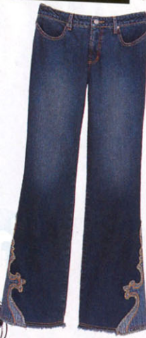
Paris Blues, $48; department stores (Ride 'em, cowgirl)