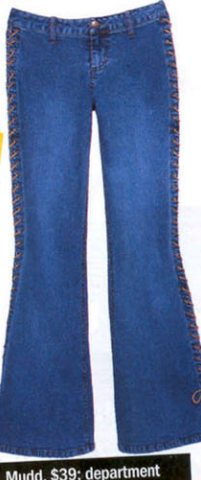
Mudd, $39; department stores (Square-dance time)