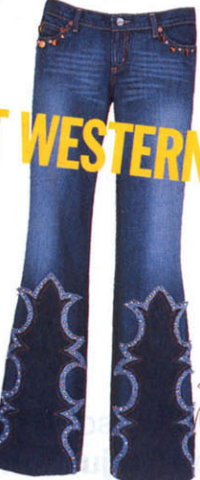
Todd Oldham Jeans, $69.50; 866-ENJOY-TJ