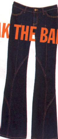
Rouge Soixante-Trois, $114; Fred Segal, L.A.