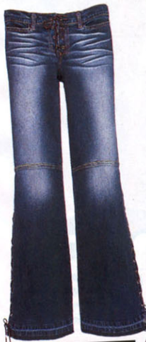
Let Me B., $39.50; Wetseal.com (Get on that horse)