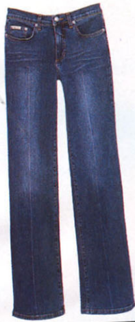
Bella Dahl, $124; Saks Fifth Avenue (Fit like a glove)