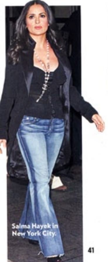
Salma Hayek in New York City.