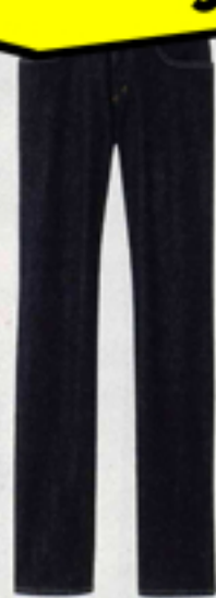
DKNY Jeans, sizes 2-16, $48, 800- 777-4524 for stores