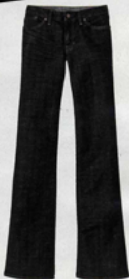
Gap, sizes 0-14, $70, gap.com