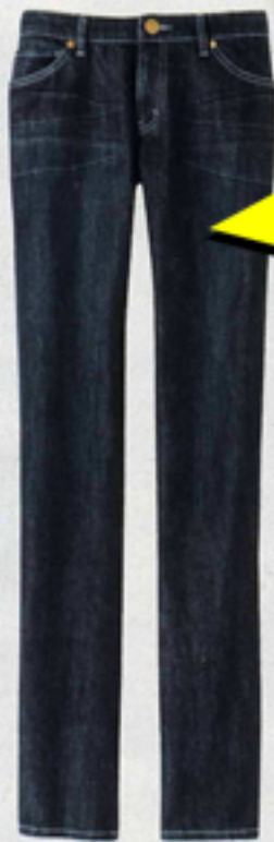
Jordache , waist sizes 24-32, 32" and 34" inseams, $69, Macy's, 800-343-0121