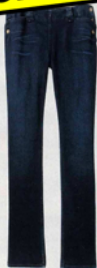
Lauren Jeans Co. Ralph Lauren, sizes 2-16, $100, select Macy's, 800-343-0121